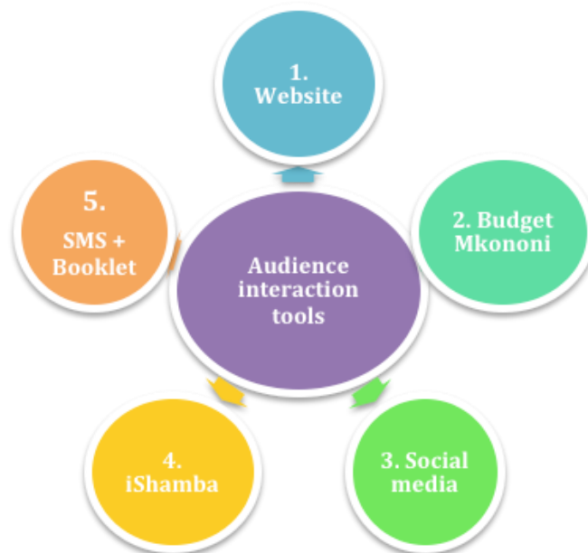
Figure 1. Don't Lose the Plot Communications Platforms

The feedback was integrated into the tool, as were recommendations from young Tanzanian farmers, who tested a Swahili language version of the tool, launched about 3 weeks later.