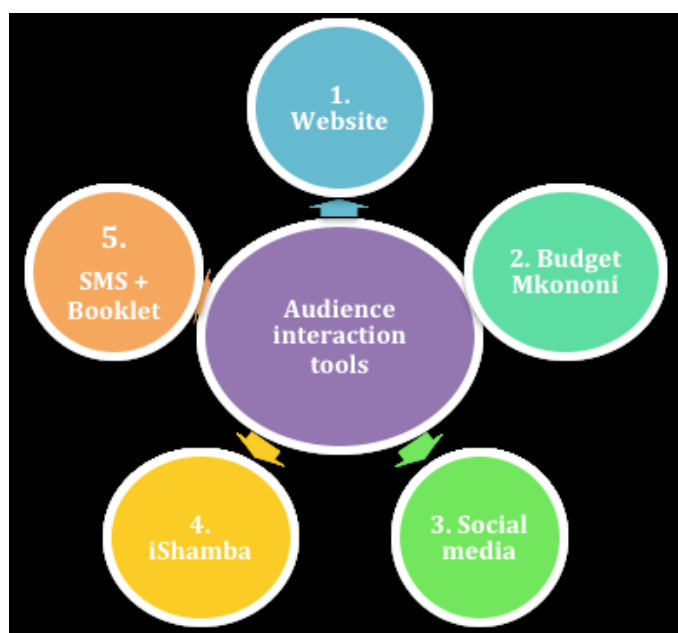
Figure 1: Don't Lose the Plot Communications Platforms

The feedback was integrated into the tool, as were recommendations from young Tanzanian farmers, who tested a Swahili language version of the tool, launched about 3 weeks later.